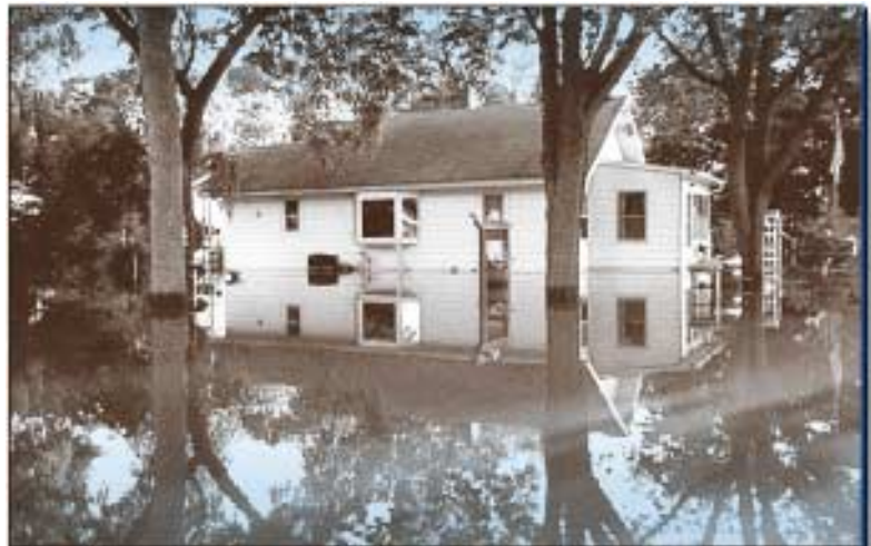
Ninety-eight homes have been removed from the floodplain in "Cedar City."

The first 12 properties were purchased with CDBG grants. The other 87 were purchased with money from FEMA HMGP grants (75 percent) and state and local community financing (25 percent) assisted by CDBG grants. The total cost of the program was $4,330,000. This expense includes acquisition, demolition, appraisals, relocation assistance, closing and legal costs. Of the 89 families relocated, 46 found replacement housing in Cedar Falls, 18 relocated to nearby Waterloo and 25 moved to other areas of Iowa. Local officials say there was little loss to business or the tax base.