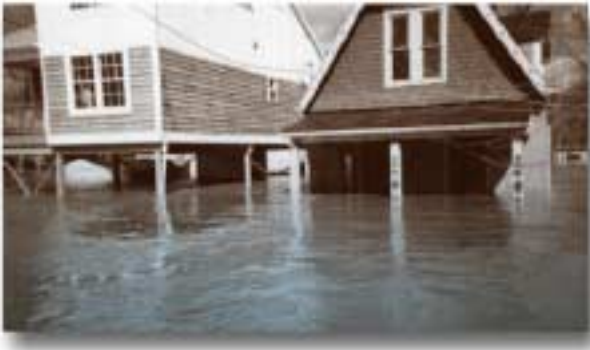
Homes inundated by flood waters.

Flooding is the number one natural hazard for Clermont. The flood of 1997 was one of the largest in 30 years and the second federally declared flood suffered in the county in two years. Because of high flood risk and past events that have impacted the county, its residents and its businesses, Clermont has taken aggressive actions to alleviate further damage from flooding.